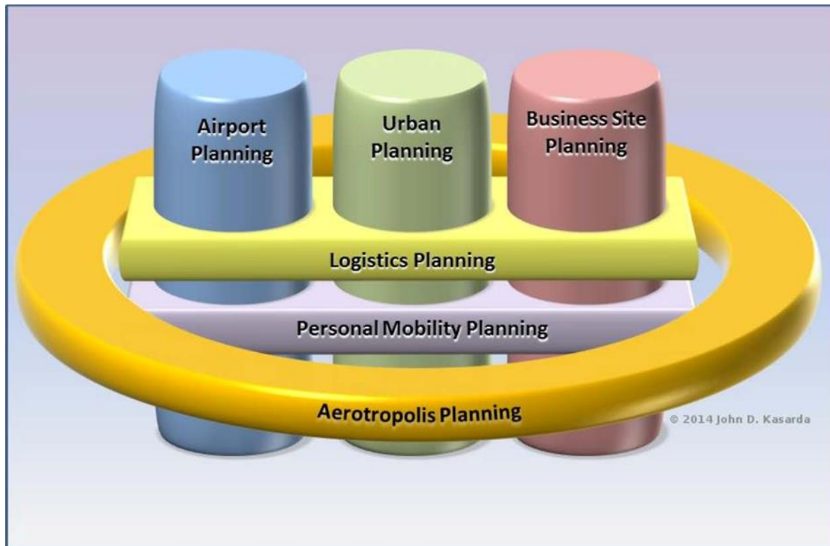
Figure 3: The Ring of Aerotropolis Integrated Planning

Figure 3 illustrates the ring of aerotropolis integrated planning, which encompasses airport, urban, and business site planning domains. Aerotropolis planning is unique in that business, urban, airport, and surface transport objectives are addressed together to foster personal and logistics mobility along with economically and socially desirable development. Such integrated planning is necessary if the full set of benefits for aerotropolis firms and places are to accrue. Aerotropolis integrated planning can also serve as an antidote to the congestion, sprawl, and unsightliness that frequently results from organic, haphazard development around airports, detracting from the airport area's operational efficiency and image while generating community conflicts.