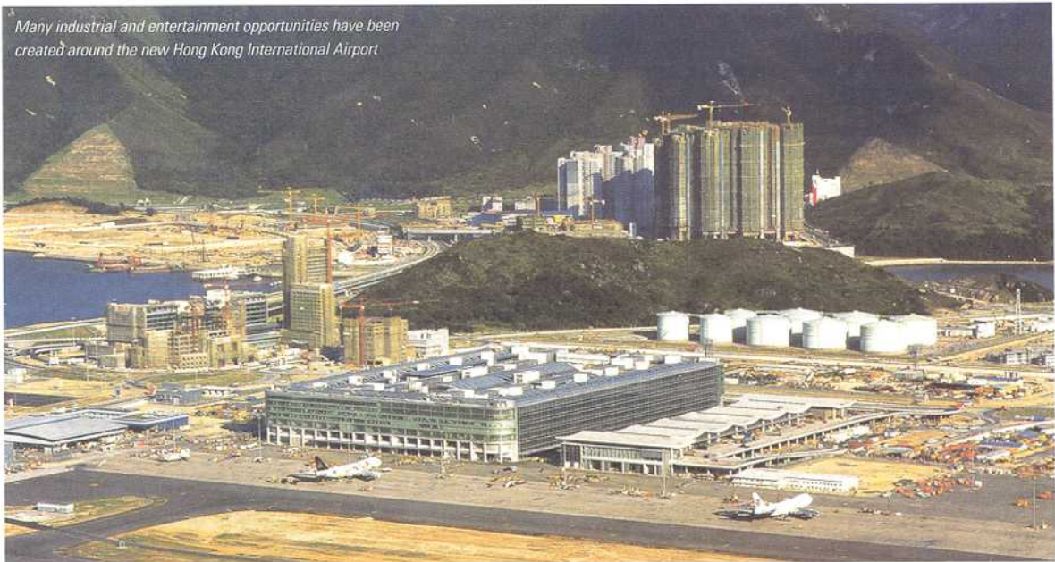
Many industrial and entertainment opportunities have been created around the new Hong Kong International Airport

The advent of e-commerce further raised the competitive priorities of speed and agility. According to Forrester Research, 166 million packages were shipped in 1999 by Internet retailers (e-tailers), with approximately 70% going by express delivery. Despite the recent death of many dot.com companies, e-commerce is continuing to mushroom. E-tailers